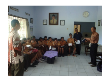
PKKA volunteer and scholarship recipients

Our scholarship program apparently strengthens new hope to our school affiliates which are losing students. This is an area where PKKA will focus more when planning the scholarship disbursement in the future.