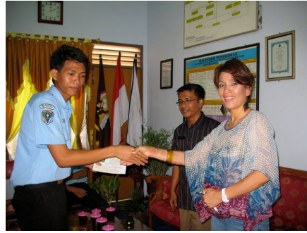
The delivery of the PKKA scholarship at the Christian Vocational School 5 in Klaten.