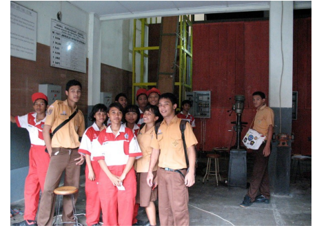
PKKA adopted students in front of the practicum area of the Catholic Vocational School Leonardo in Klaten.